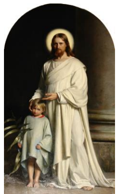
Christ and a boy Carl Heinrich Bloch (1834-90)